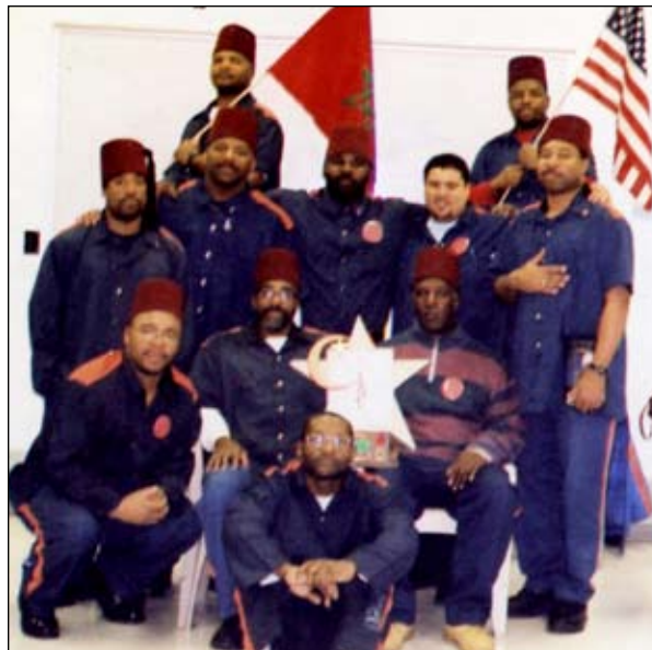
Moorish Islamic Prison Ministry Outreach Program members

Moorish diet and segregation claims may challenge conditions of confinement. Although lawful incarceration withdraws or limits many privileges and