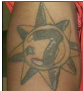
The Five Percenters split from the Nation of Islam. Because of the group’s lack of structure and young members, the S.C. Department of Corrections labeled the group a security threat.