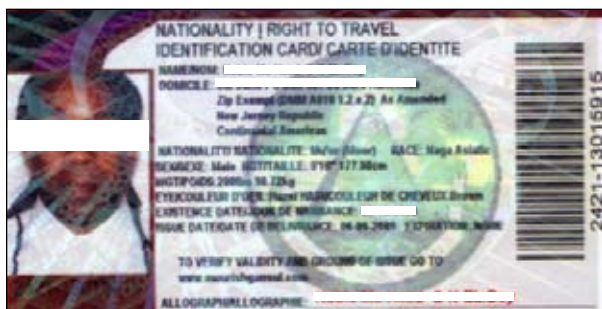
Moorish Nationality ID and Right to Travel

Officers conducting traffic stops may have encountered drivers with Moorish documentation, such as driver’s licenses, car registration, passports, and Social Security cards. Moors attempt to pass these documents as legal U.S. forms of identification [See Moorish Republic Trust, page 9].