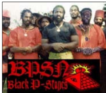
The Black P Stone Nation gang converted to Islam after their leader Jeff Fort converted. They changed their name to El Rukn.

El Rukn is also allied with the Almighty Latin Kings Nation, the most organized Hispanic street gang in the U.S., known for murder, drug trafficking, and robberies.