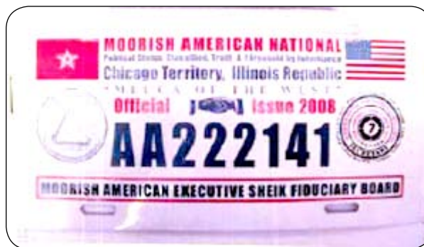
Example of a Moorish ID and License Plate

became popular in Baltimore and became the second largest Moorish faction after the Moorish Science Temples of America. Breakaway members of the Reincarnated Temples later joined the Nation of Islam gang.