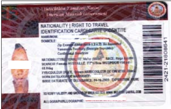
Right-to travel ID card; Yamassee Territory, GA