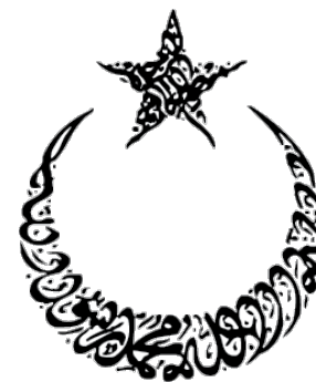
Seal of Sulaiyman (Soloman): Symbol off the Moroccan flag. The star is green to honor Islam and refers to the five pillars of Islam.